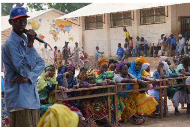
Theatre of cultural traditions and ceremonies , Youth forums and football in Chargel during Youth Advocacy Sports