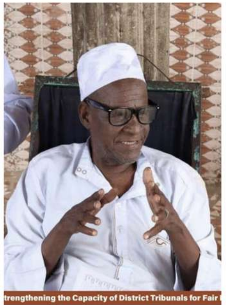
Strengthening the Capacity of District Tribunals for Fair Dispensation