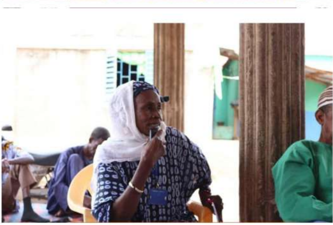
Strengthening the Capacity of District Tribunals for Fair Dis