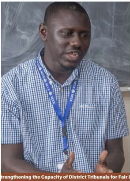
Strengthening the Capacity of District Tribunals for Fair Dis