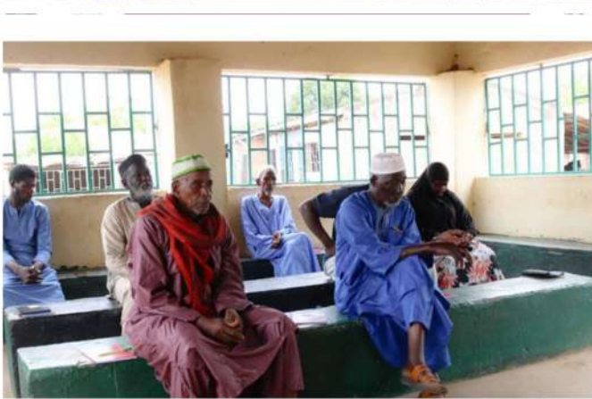
Strengthening the Capacity of District Tribunals for Fair Dispensation