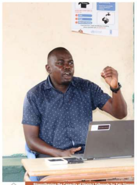
Strengthening the Capacity of District Tribunals for Fair Dispensation