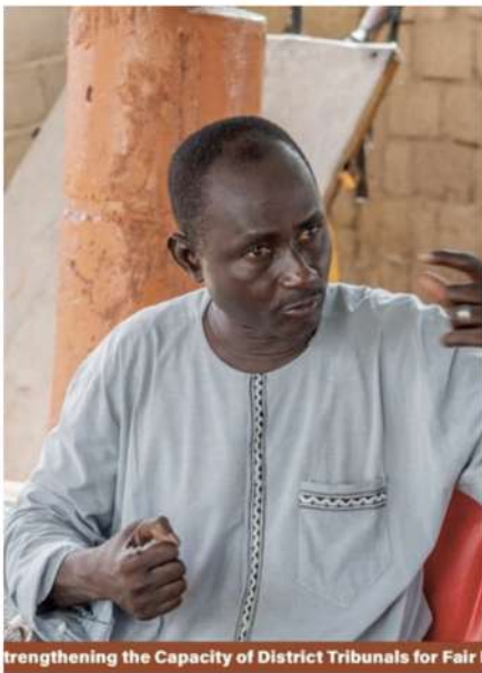
Strengthening the Capacity of District Tribunals for Fair Dispensation