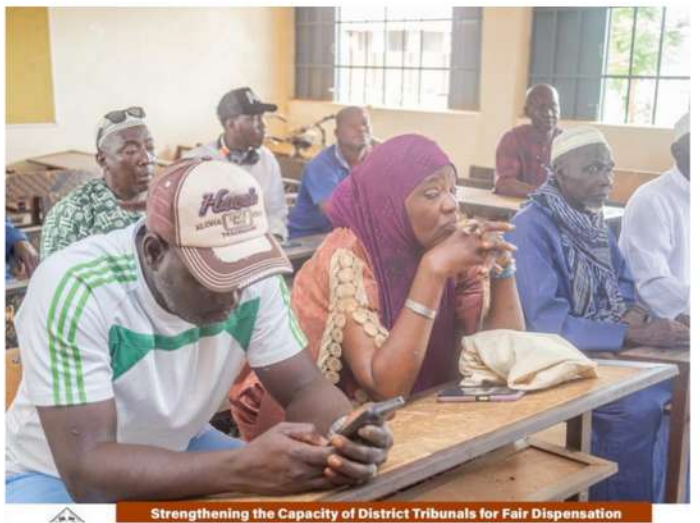
Strengthening the Capacity of District Tribunals for Fair Dispensation