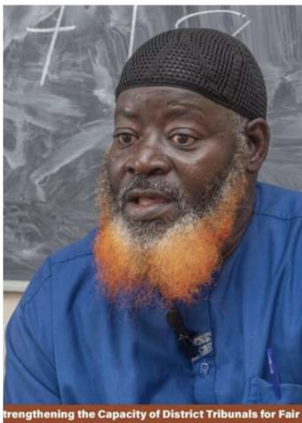
Strengthening the Capacity of District Tribunals for Fair Dispensation