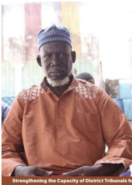
Strengthening the Capacity of District Tribunals for Fair Dispensation