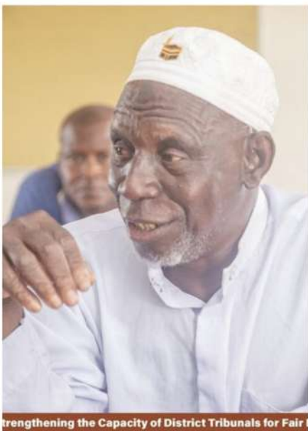
Strengthening the Capacity of District Tribunals for Fair Dispensation