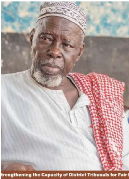
Strengthening the Capacity of District Tribunals for Fair Dis