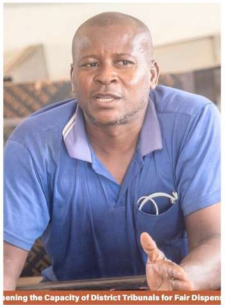
Strengthening the Capacity of District Tribunals for Fair Dispens