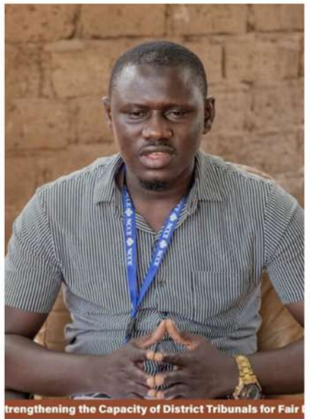
Strengthening the Capacity of District Tribunals for Fair Dis