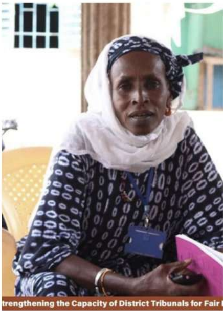
Strengthening the Capacity of District Tribunals for Fair Dis